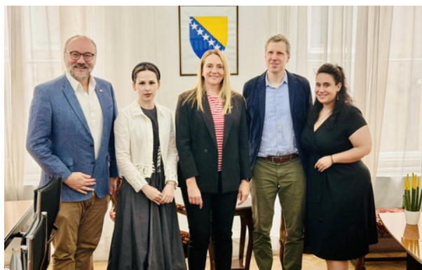
Meeting at the Ministry