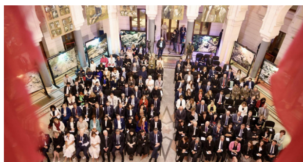
Commemorative Concert at Sarajevo City Hall