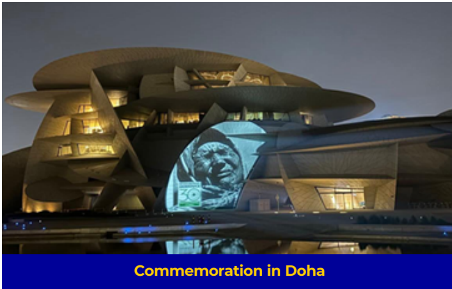
Commemoration in Doha