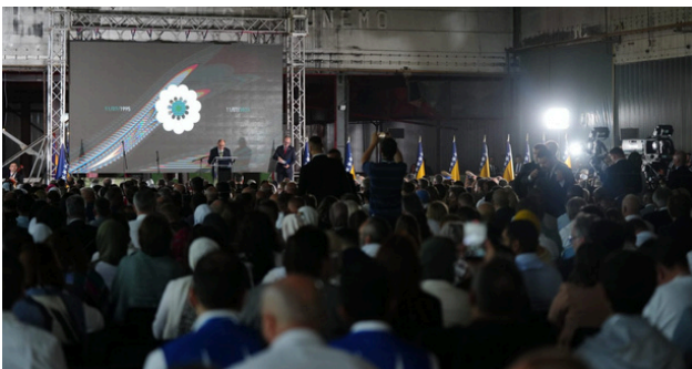
Commemoration in Srebrenica

particularly significant as it followed the adoption of United Nations General Assembly Resolution 78/282 in May 2024, which established 11 July as the International Day of Reflection and Commemoration of the 1995 Genocide in Srebrenica. The resolution, reaffirmed the international community's commitment to acknowledging the crime of genocide, combating denial and revisionism, and promoting education and remembrance as essential tools for prevention.