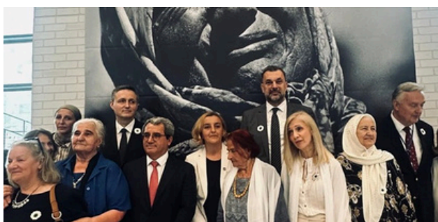
Commemoration at the UN Headquarters