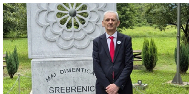
Commemoration in Italian Cities