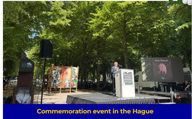
Commemoration event in the Hague