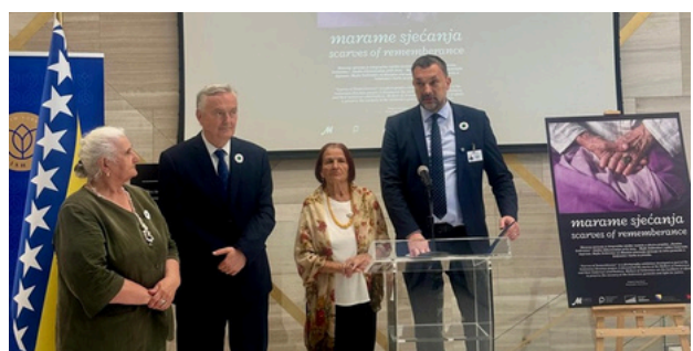
Exhibition “Scarves of Remembrance”

promote the values of peace, tolerance, and mutual respect. In his speech, the minister emphasized that the exhibition is not merely a collection of stories and images but a living testimony to survival, truth, and dignity. He called for a continued fight against denial and for preserving the truth as a foundation for a more just future.