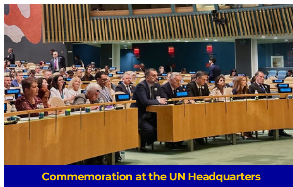
Commemoration at the UN Headquarters