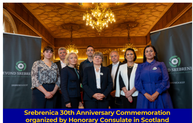
Srebrenica 30th Anniversary Commemoration organized by Honorary Consulate in Scotland