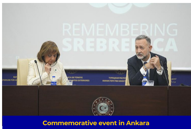
Commemorative event in Ankara