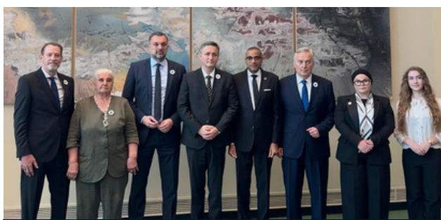
Commemoration at the UN Headquarters