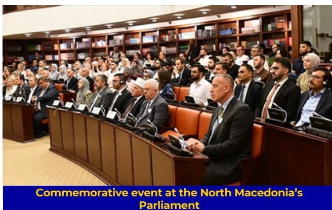
Commemorative event at the North Macedonia's Parliament