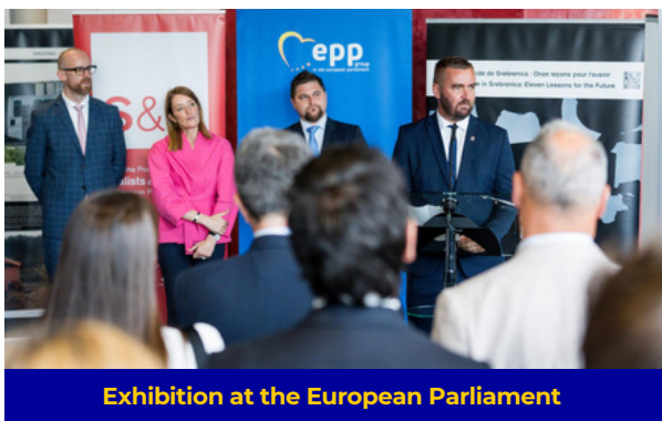
Exhibition at the European Parliament

On July 26, 2025, Ambassador Kemal Muftić attended and addressed a commemoration in Sydney marking the 30th anniversary of the Srebrenica genocide and the UN resolution on its remembrance, organized by the Bosnia Community Council NSW and the Universal Peace Federation Oceania. The event featured speeches by academics, survivors, and Australian MP Ed Husic, highlighting the importance of memory, justice, and global solidarity. A panel discussion and cultural program, including a performance by the "Modra rijeka" choir, emphasized both remembrance and the ongoing relevance of Srebrenica in the face of global injustices. Survivors shared moving testimonies, while scholars spoke on genocide denial and the dangers of glorifying war criminals. Particular attention was given to the symbolism of the Srebrenica flower and the trauma carried by survivors and refugees. The program also acknowledged the current suffering of civilians in Gaza and other global conflict zones. The commemoration served as a reminder that remembrance must be paired with action to prevent future atrocities.