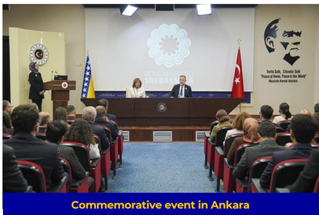
Commemorative event in Ankara