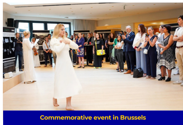
Commemorative event in Brussels