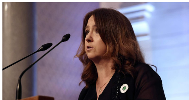
Ambassador of the Republic of Italy to Bosnia and Herzegovina Sara Eti Castellani