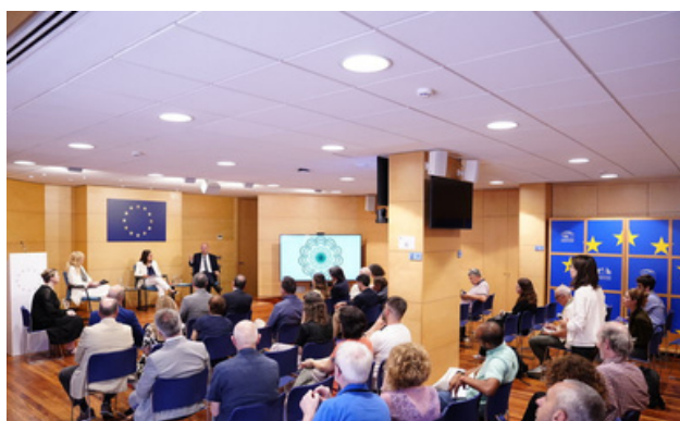
Commemoration in Madrid