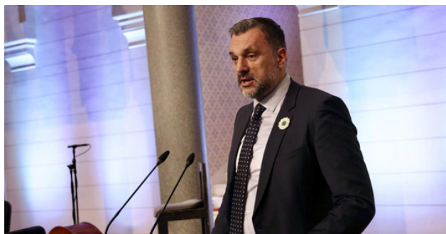
Minister of Foreign Affairs of Bosnia and Herzegovina Elmedin Konaković

Hosts of the commemorative concert included Minister of Foreign Affairs of Bosnia and Herzegovina Elmedin Konaković, Ambassador of the Republic of Italy to Bosnia and Herzegovina Sara Eti Castellani, and the Mayor of Sarajevo Predrag Puharić, each of whom underscored the profound symbolic, cultural, and moral significance of remembrance through art.