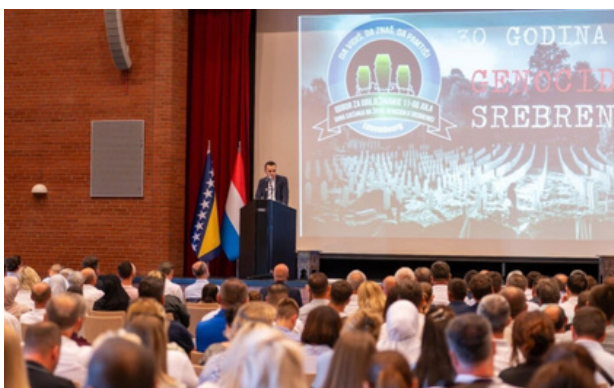
Commemoration in Luxembourg