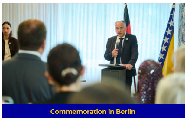
Commemoration in Berlin