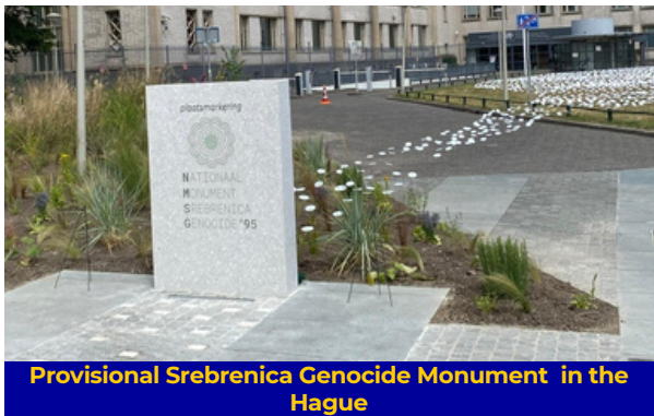
Provisional Srebrenica Genocide Monument in the Hague