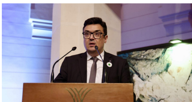
Mayor of Sarajevo Predrag Puharić