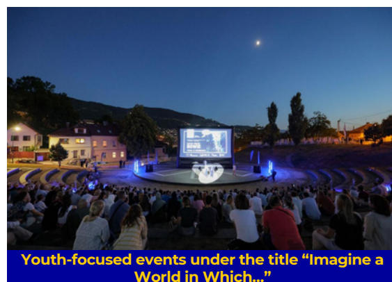
Youth-focused events under the title "Imagine a World in Which..."