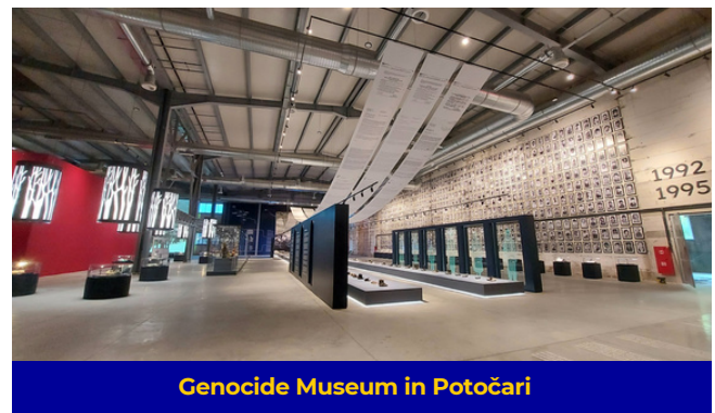
Genocide Museum in Potočari