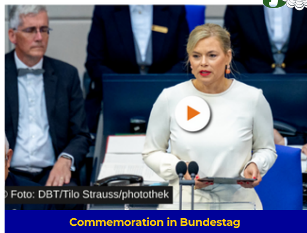
Commemoration in Bundestag

survivors who pushed for justice and the recognition of the massacre as genocide, and continue to stand against denial.