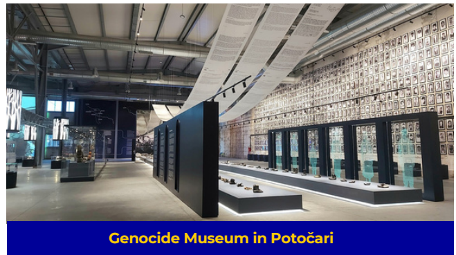
Genocide Museum in Potočari

On July 11, 2025, the Genocide Museum in Potočari was officially opened within the Srebrenica Memorial Center, serving as a permanent space of remembrance and education dedicated to the victims of the genocide committed against Bosniaks. The museum covers the period from 1992 through the events of July 1995 and the ongoing efforts to locate, identify, and honor those murdered. Among the most powerful features are reconstructions of mass execution sites, including a replica of the Dom kulture in Pilica, alongside exhibits of mass graves, recovered personal belongings, survivor testimonies, and photographs of victims. Created with the full financial support of the Turkish Cooperation and Coordination Agency (TIKA) under the patronage of President Recep Tayyip Erdoğan, the museum aims to preserve memory and serve as a warning that genocide must never be repeated. The opening ceremony was attended by high-ranking officials, including the President of the Grand National Assembly of Türkiye Numan Kurtulmuş, Bosnia and