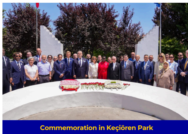
Commemoration in Keçiören Park