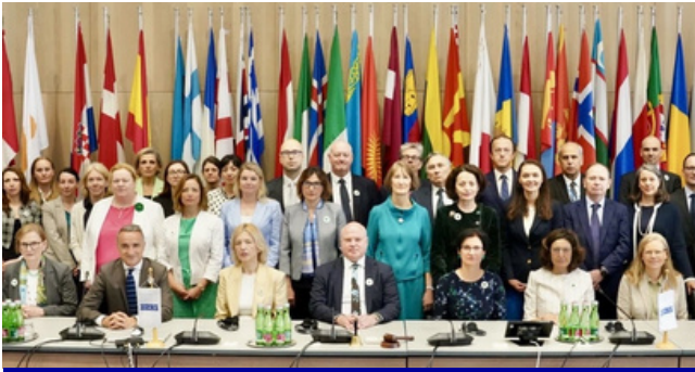
Commemoration at the UN Headquarters in Vienna