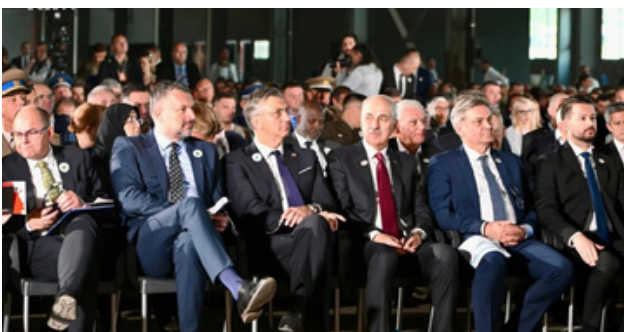
Commemoration in Srebrenica