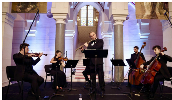
Maestro Griminelli and the string quintet of the Luciano Pavarotti Foundation Orchestra

On July 10, 2025, a commemorative concert marking the 30th anniversary of the genocide against the Bosniaks of the UN Safe Zone of Srebrenica was held at Sarajevo City Hall. The event was organized by the Ministry of Foreign Affairs of Bosnia and Herzegovina, the Embassy of the Republic of Italy in Bosnia and Herzegovina, and the City of Sarajevo. The concert featured renowned Italian flautist Maestro Andrea Griminelli, who has collaborated with many world-famous orchestras and conductors.