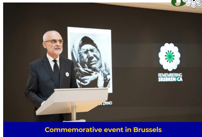
Commemorative event in Brussels

"8,372 Seconds", including a rendition of "Srebrenica Inferno", which left a strong emotional impact on attendees.