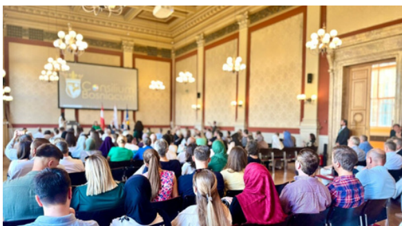
Commemoration in Vienna